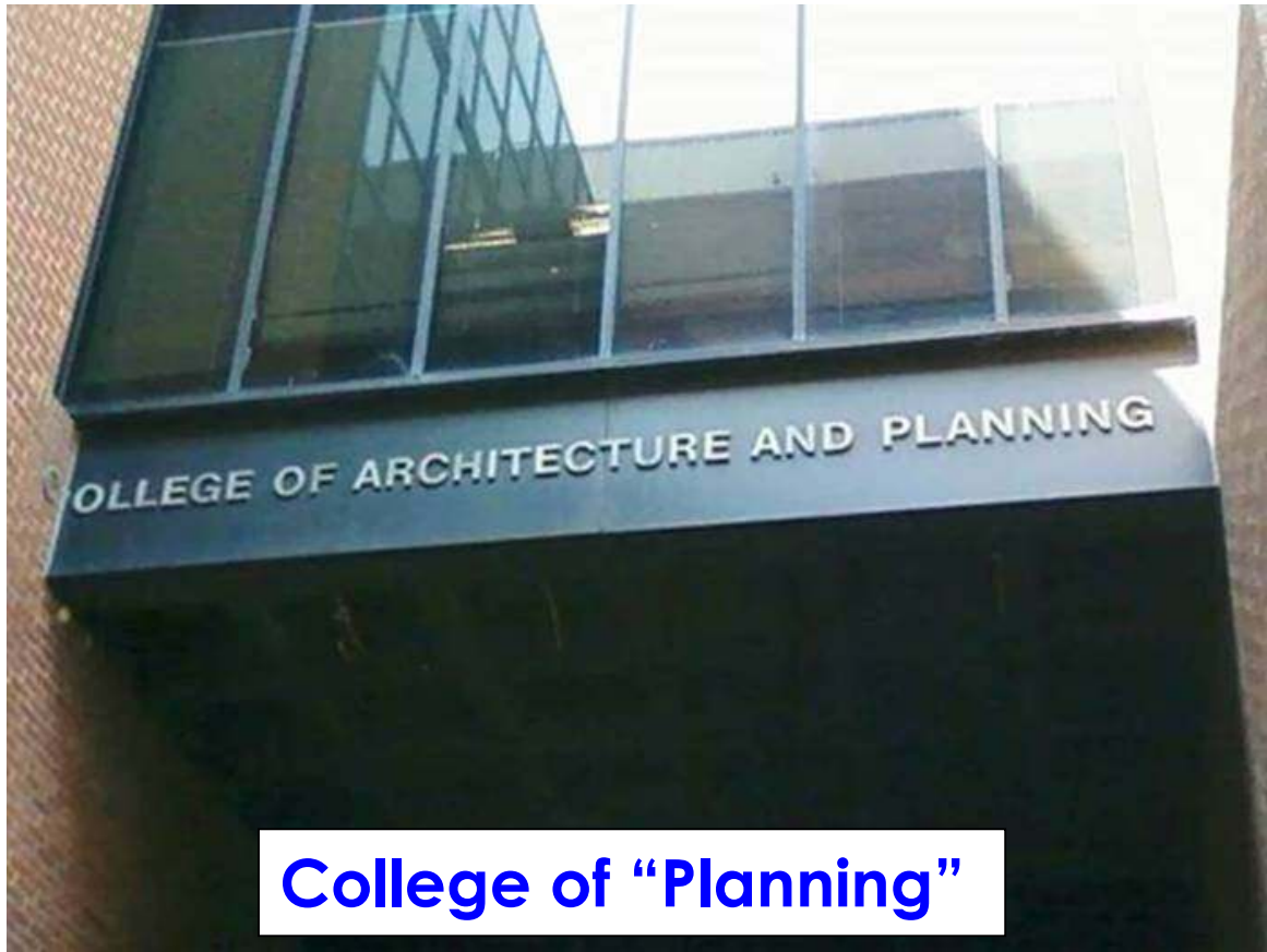
College of "Planning"

Someday us old folks will use cursive writing as a secret code.