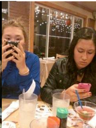
Having a conversation with your BFF