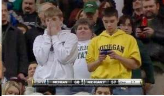
Cheering on your team