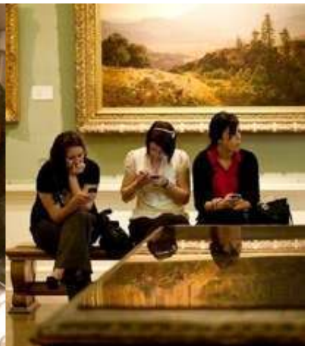
A visit to the museum