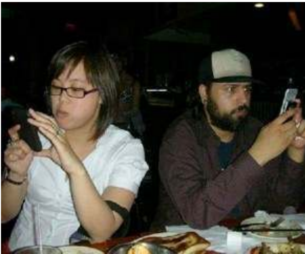
Out on an intimate date