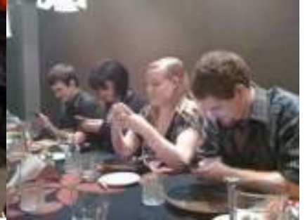
Having dinner with your friends