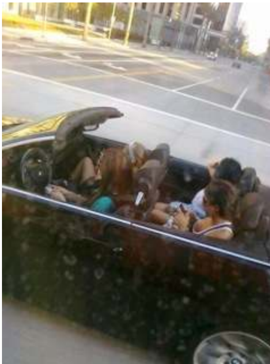
Enjoying the sights