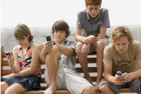
A day at the beach

The day that Albert Einstein feared has finally arrived!