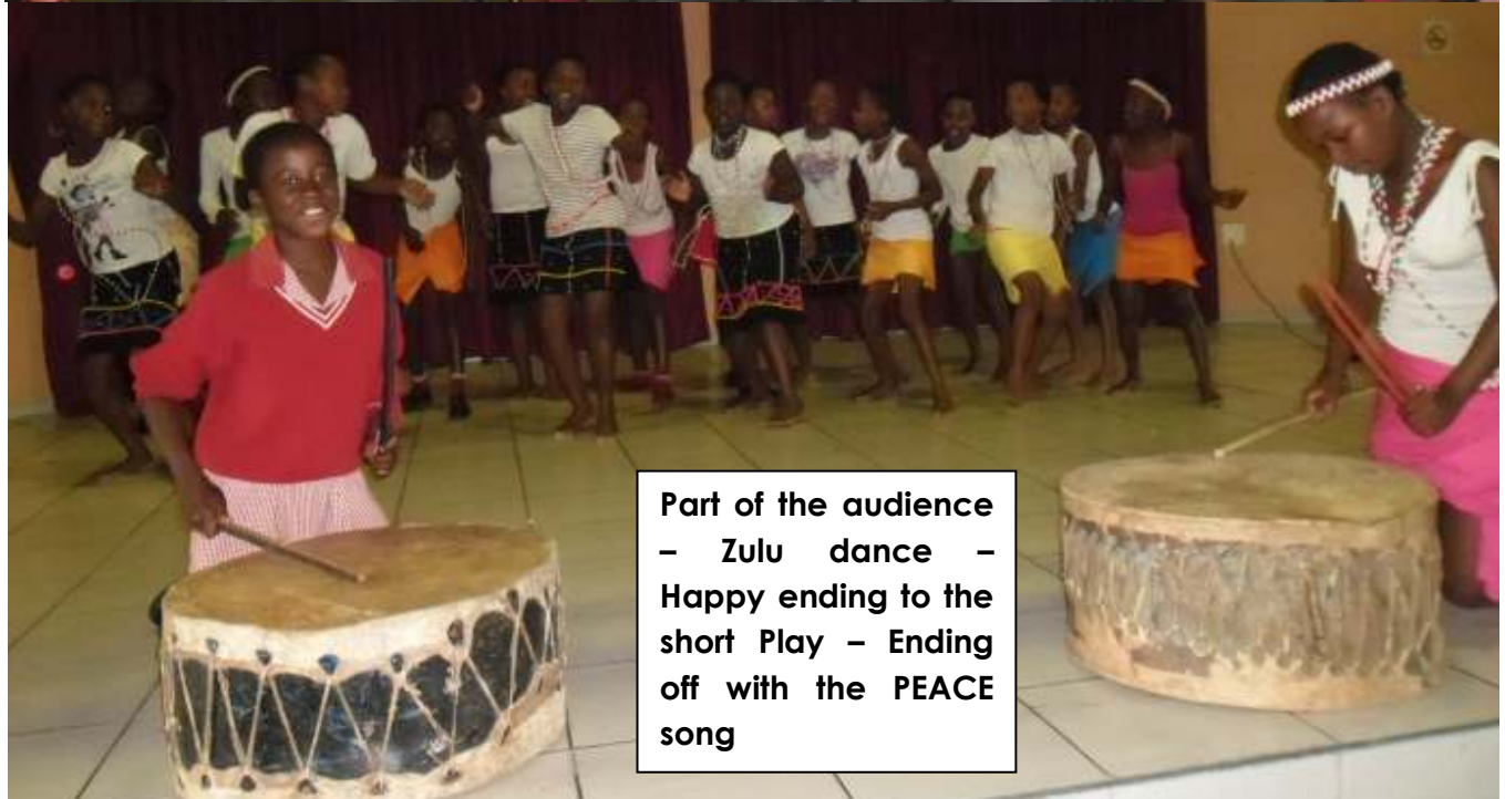
Part of the audience - Zulu dance - Happy ending to the short Play - Ending off with the PEACE song