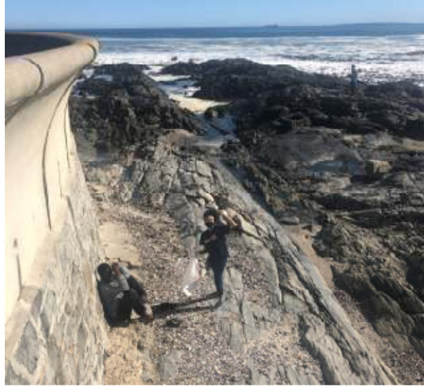
Inga in action

We filled 9 big bags of rubbish, which mostly comprised cigarette butts, plastic, wrappers, glass bottles, bubble wrap, plastic bags, bottle caps, and general litter. The Ward Councillor, Nicola, also joined us on the day and she arranged for the municipality to come and collect the filled bags. We were also joined by the guys from VOX Internet, who helped us cleanup the beach and provided everyone with gloves to pick up the rubbish.