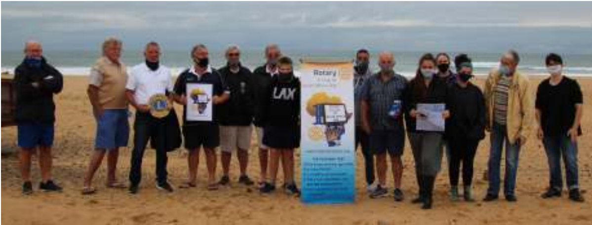
Rotary and Lions – This photo also appeared in the Talk of the Town Port Alfred newspaper

The Port Alfred Cluster, together with the Lions Club, Round Table, Enviro Club and Interact Club of Port Alfred High School and friends of Rotary divided into 3 groups to start the cleanup at West Beach, East Beach and the Kowie River mouth.