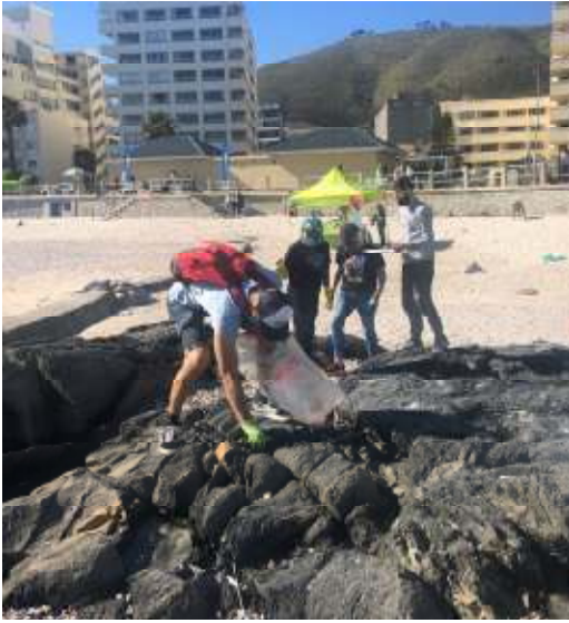
Hard at work