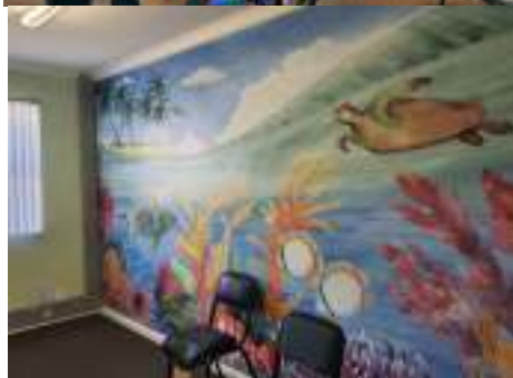
Clockwise from top left – Selling raffle tickets for the bike. With Interactors, taking stock of items donated and purchased. Then 3 photos showing effect after furnishings and finally the original room, with 2 chairs and a mural