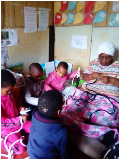
Above: Little ones and Gogos (grandmothers in IsiZulu) learning to weave their magic!

This intervention has proved to be critical for basic understanding on how to create craft products in order to sell and make a living. The groups have been very receptive. Our Rotary E-Club also sent 4 child minders to a First Aid course so that the Play Centres have basic resources and understanding of what to do whilst looking after little ones.