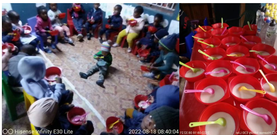
Above: Children in Early Childhood Development Centres enjoying maize meal porridge