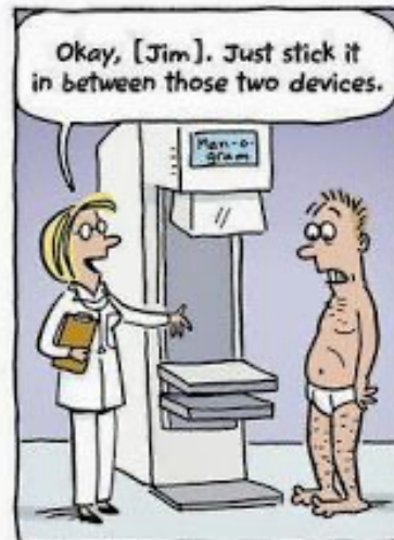
If Women Ran the World