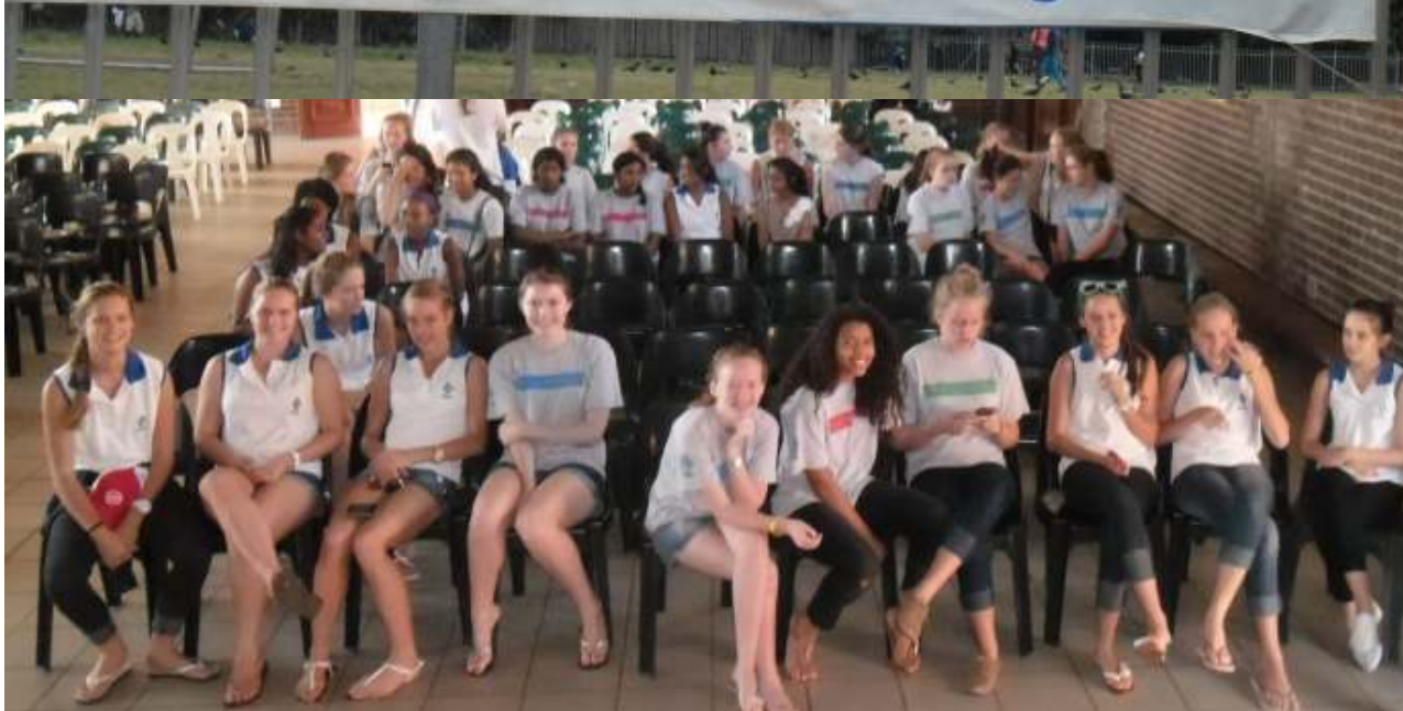
Our Lady of Fatima Interactors in relax mode before the activities started.