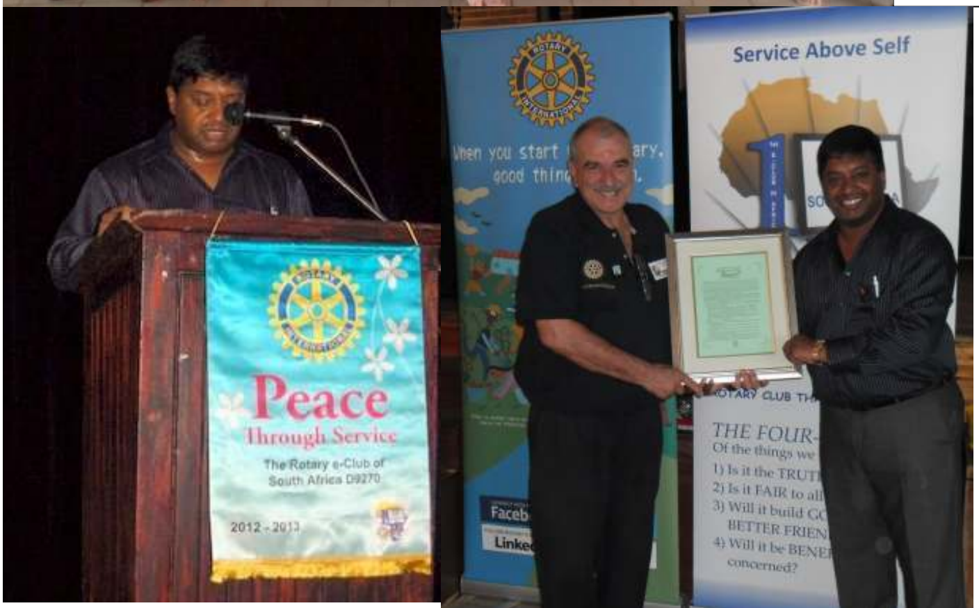
Presentation of Peace Declaration