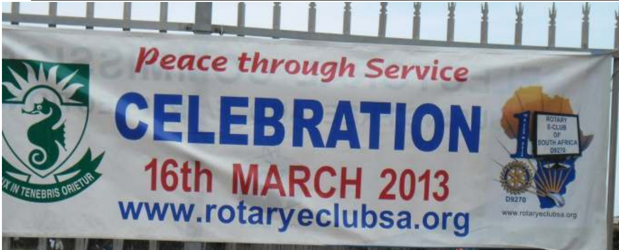
Peace banner on the Addington Primary School perimeter fence