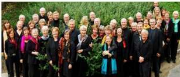
Vestre Aker Dusjlag