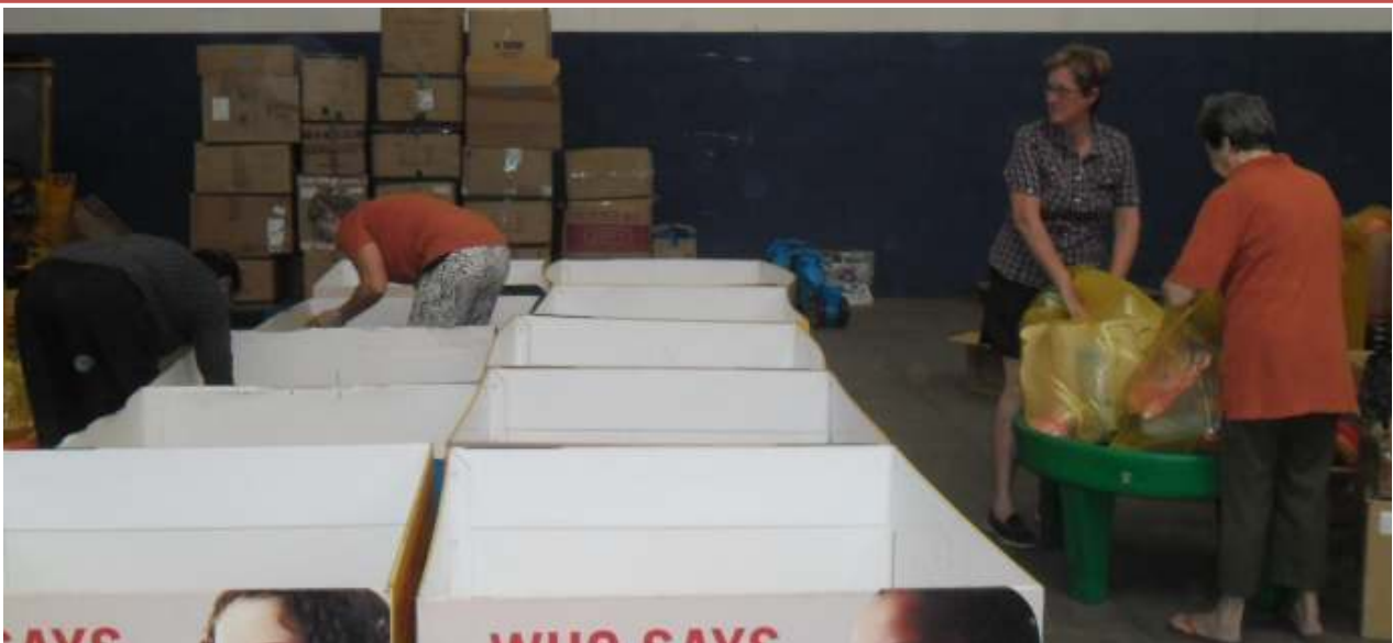
Didn't take long for the 'A-Team' plus an 'S' to clear all the toys and reach for the bottom of the sorting boxes.