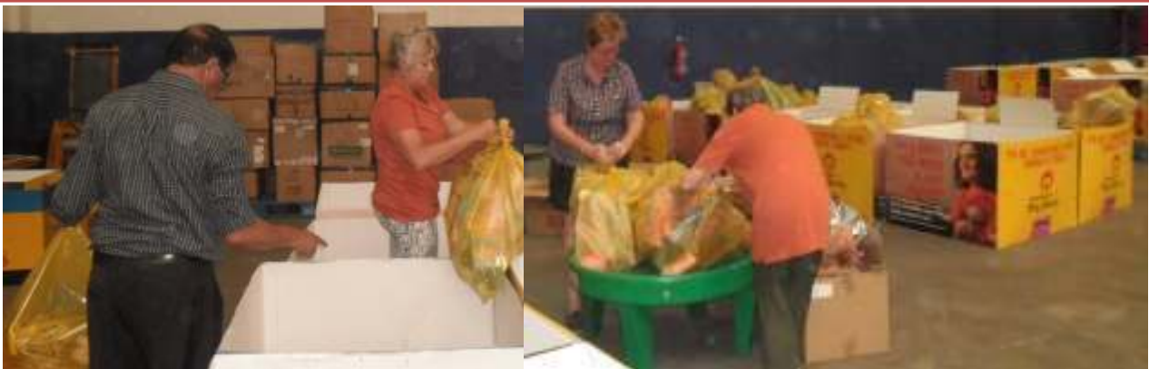
Toys all sorted, now the bagging and labelling of the various categories takes place